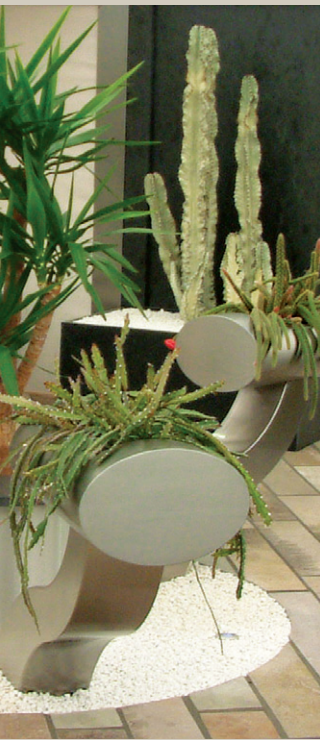
‘A place of excellence, tranquility and tradition’ The Times Weekend

For growing under glass, Barry will create the perfect environment for your indoor garden. He can advise on the best site for your glasshouse, the ventilation and heating systems you need, and the types of plants that thrive under glass.